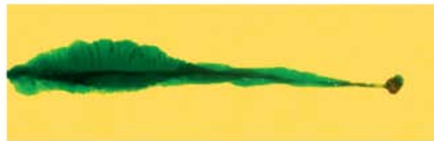
Outstanding Gold Dot performance. Here, Gold Dot shows optimum penetration and expansion through bare gelatin.

We know you can count on Gold Dot® because we hold it to the highest of standards. We make sure that it will excel in stringent handgun ammunition tests developed by the Federal Bureau of Investigation for service-class handgun cartridges. Look below for an example of Gold Dot results. The load is a 38 Special +P Short Barrel Gold Dot fired from a 2-inch revolver—a real challenge for other bullets. The numbers tell you that this load, like all Gold Dot offerings, is an excellent performer.